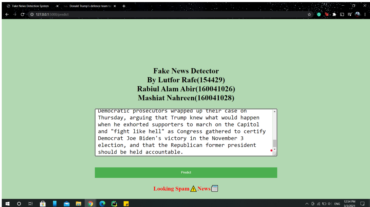
Figure 3.2 : The Interface