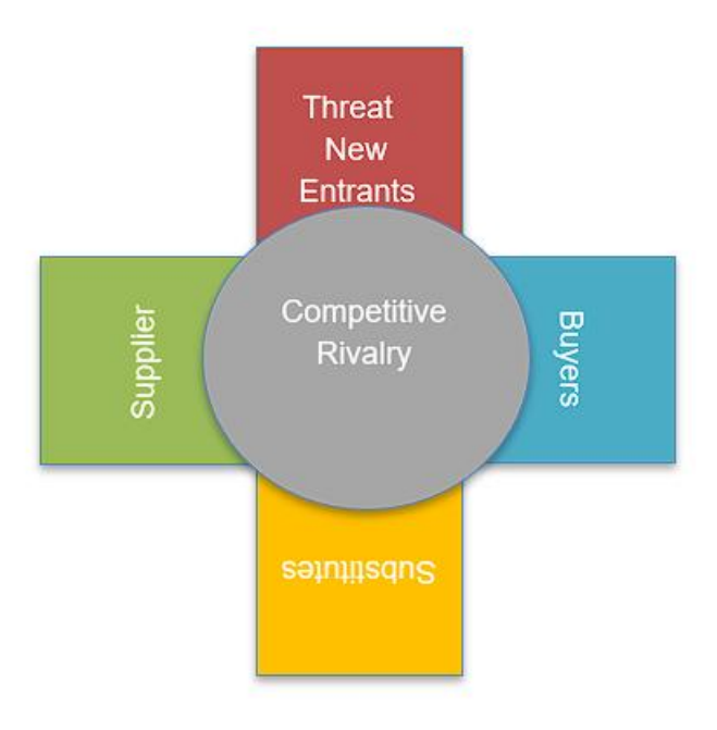
Figure 3: Porter's Five Forces