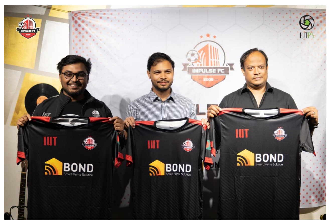
Figure 2: Bondstein become Impulse FC sponsor

Bondstein Technologies employs affiliate marketing strategies in conjunction with other reputable brands in Bangladesh. Engaging in a diverse range of activities. The process of identifying the placement of Bondstein Technologies' promotional banners across multiple markets during their advertising initiatives. Bondstein Technologies has adopted a significant marketing approach by serving as the present title sponsor of IUT Impulse FC. Additionally, they provided backing for various academic celebrations and endeavours at the university.