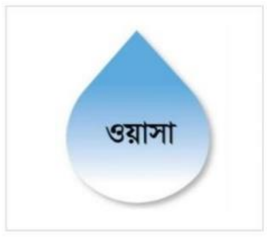
Figure 5: DWASA

Bondstein developed a Smart Water Management System (SWMS) for the Dhaka Water Supply and Sewerage Authority (DWASA) to address the water crisis in Dhaka, which is the capital city of Bangladesh and one of the most populous cities in the world. The SWMS utilizes IoT-enabled sensors, cloud computing, and machine learning algorithms to monitor the water supply and