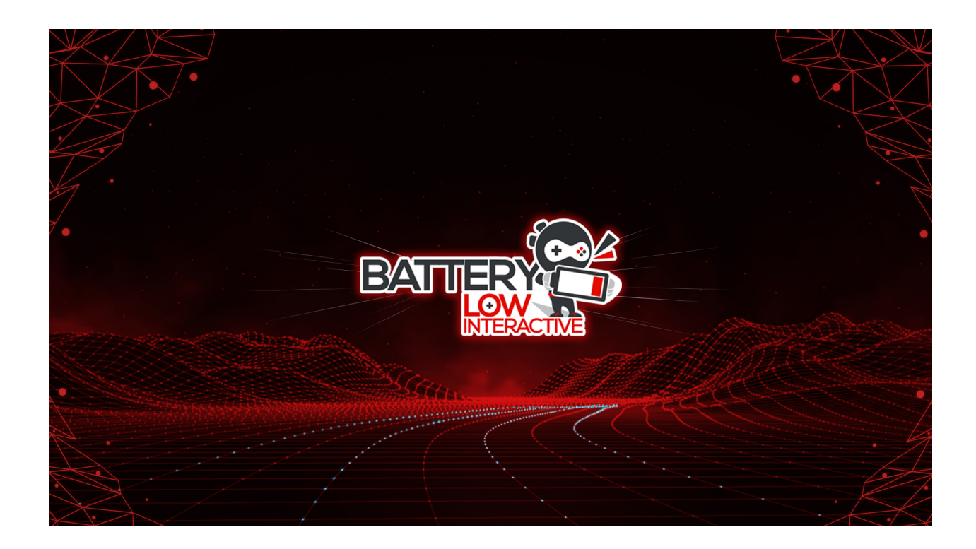
Logo of Battery Low Interactive Ltd

This internship report is submitted to the department of Business and Technology Management(BTM) at Islamic University of Technology(IUT) for the course BTM 4800