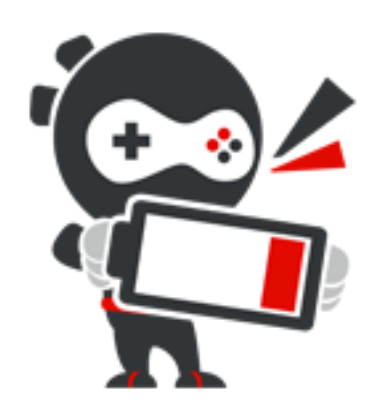
Chapter 3: Industry Analysis