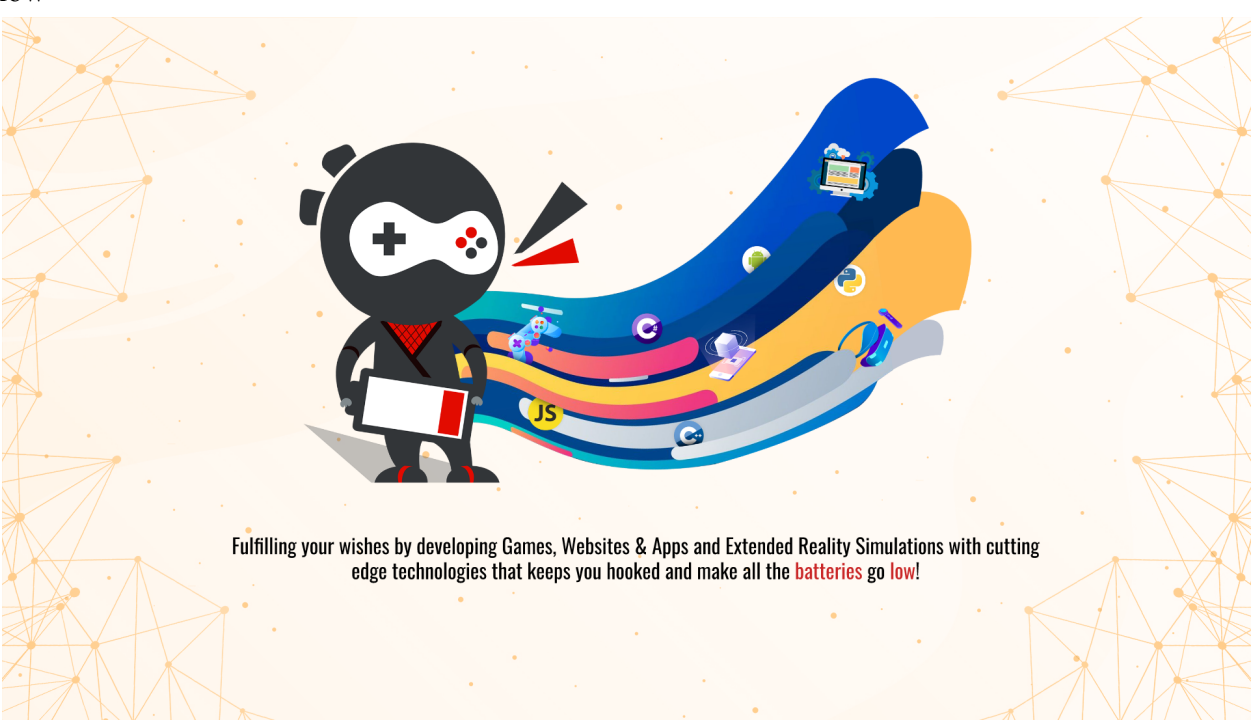
Logo and Motto of Battery Low Interactive Ltd.

The tagline, "Fulfilling your wishes by developing games, websites & apps and extended reality simulations with cutting edge technologies that keeps you hooked and make all the batteries go low"