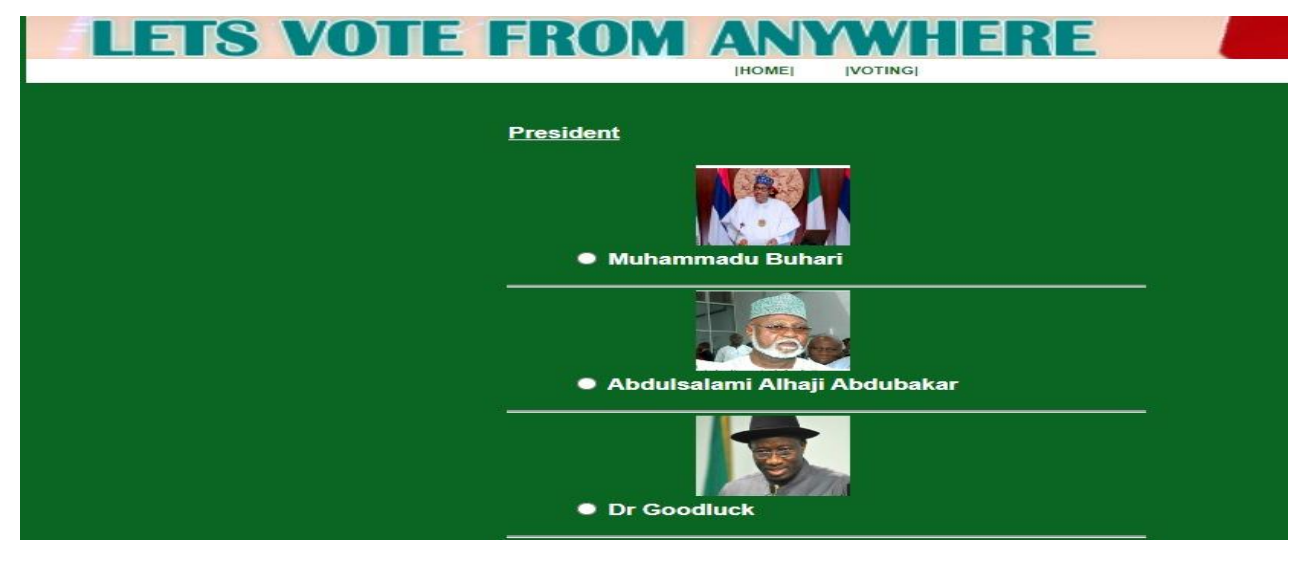
Figurce 11:Voting Page.

vi.Voting Page: This is the main voting page each position has its own voting page, 'it contains all the candidate participating on that position: a user need to select which candidate he wants cast his vote to and click vote button to confirm his vote, after a user cast his vote on that particular position, he will automatically be redirected to voting category, on the category he can select another position to cast on his vote, if a voter try to vote again on the same position, the system will remind him that he can only cast his vote once and then discard the vote without recording it.