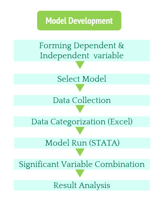
Figure 4: Flow chart of model development

In our study, the dependent variable is the decision to Jaywalk or not jaywalk, meaning it can only take one of two possible values: 1 or 0. The logistic regression model is the appropriate statistical model for analyzing data in dichotomous or binary form. In investigating pedestrian behavior and traffic safety, the logistic regression model is a statistical approach that is frequently used (Simoncic, 2001; Valent et al., 2002). Hence, in our study, we have used the logistic regression model. To develop the model, we have divided the process into a workflow diagram illustrated in the following figure.