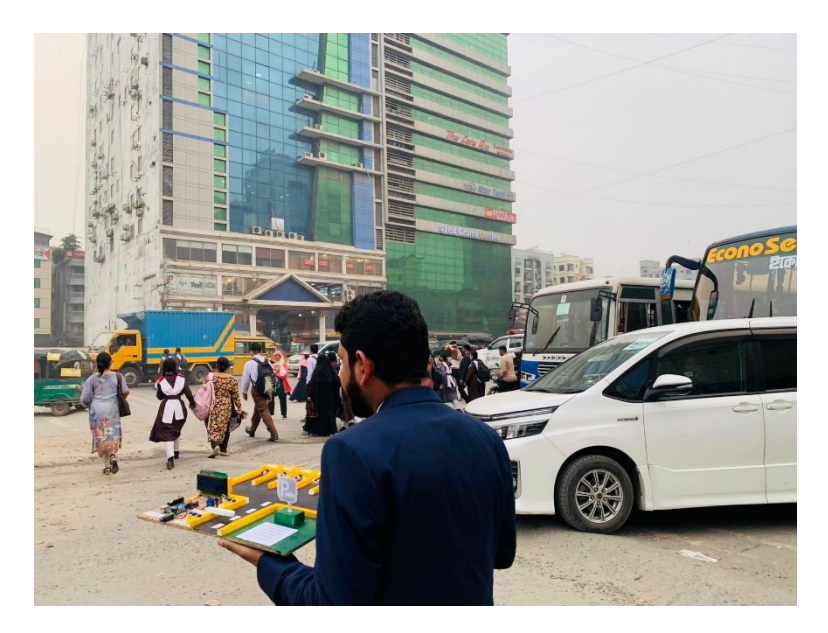
Figure 3: Jaywalking of parent-child pair in Uttara

Therefore, we finally collected 273 survey data from randomly selected students from 13 schools in Dhaka city's Mohammadpur, Dhanmondi, Tejgaon, Mirpur, Uttara, and Motijheel areas. We also ensured that the respondent's gender and educational background (English Medium, Bangla Medium, English Version, etc.) were given equal importance.