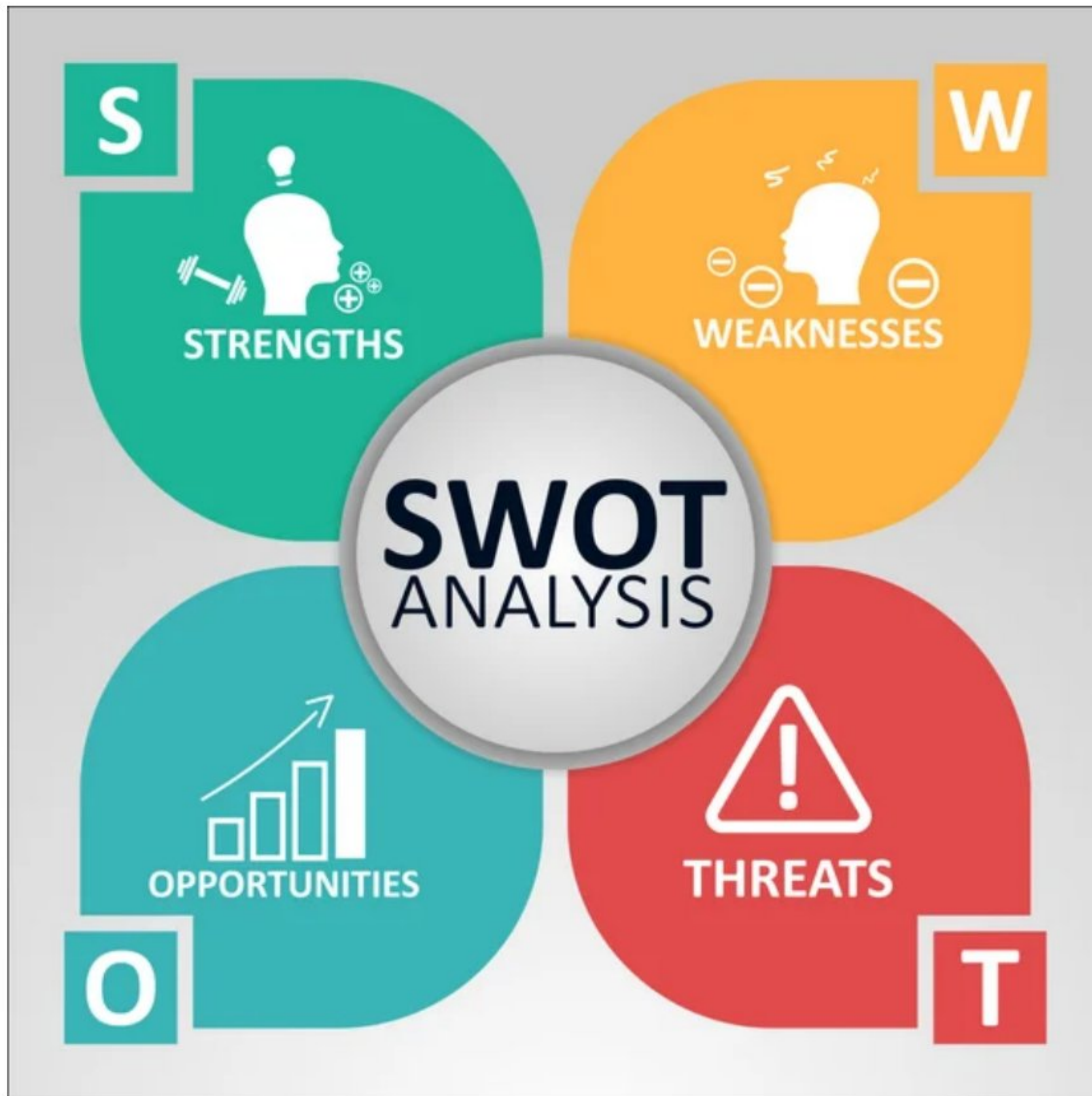
Fig 2: SWOT Analysis of Gao Tek