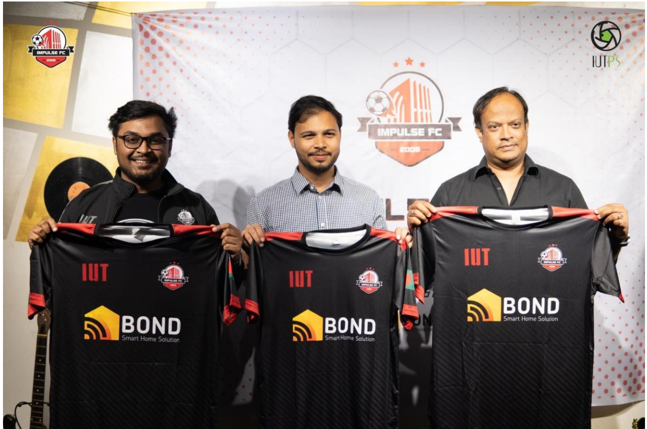
Figure 2: Bondstein become Impulse FC sponsor

Bondstein Technologies employs affiliate marketing strategies in conjunction with other reputable brands in Bangladesh. Engaging in a diverse range of activities. The process of identifying the placement of Bondstein Technologies' promotional banners across multiple markets during their advertising initiatives. Bondstein Technologies has adopted a significant marketing approach by serving as the present title sponsor of IUT Impulse FC. Additionally, they provided backing for various academic celebrations and endeavours at the university.