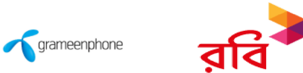
Figure 4: Competitors of Bondstein

The Internet of Things (IoT) sector is experiencing swift expansion within the borders of Bangladesh, with numerous entities offering a range of IoT-based solutions and services. Bondstein faces competition from several prominent players in the IoT sector in Bangladesh.