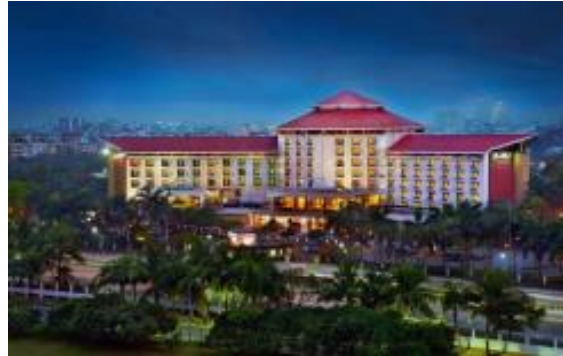
Figure 7: Radisson Blu Dhaka Water Garden

Bondstein designed and implemented a system for monitoring and controlling energy consumption in real-time at Radisson Blu Dhaka Water Garden, a luxury hotel located in Bangladesh. The hotel's energy consumption is monitored and controlled in real-time through the utilization of IoT sensors within the system. The aforementioned system acquires data from diverse sources, including energy meters, HVAC systems, and lighting systems, and conducts an analysis of the data to detect potential avenues for energy conservation. Furthermore, the system has the capability to promptly notify hotel personnel of any irregularities in energy usage through real-time alerts. The implementation of the system has yielded a reduction in the hotel's energy consumption by as much as 20%, leading to considerable financial savings. The implementation of the system facilitated the enhancement of the hotel's sustainability and mitigation of its carbon emissions, a crucial objective for the hospitality sector. Furthermore, the system offers instantaneous insight into energy usage, empowering hotel personnel to promptly address any irregularities. The implementation of this measure has resulted in an enhancement of the hotel's operational efficiency and a reduction in downtime.