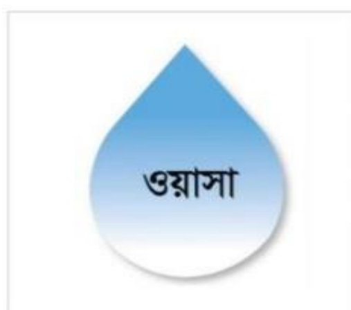
Figure 5: DWASA

Bondstein developed a Smart Water Management System (SWMS) for the Dhaka Water Supply and Sewerage Authority (DWASA) to address the water crisis in Dhaka, which is the capital city of Bangladesh and one of the most populous cities in the world. The SWMS utilizes IoT-enabled sensors, cloud computing, and machine learning algorithms to monitor the water supply and