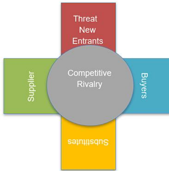
Figure 3: Porter's Five Forces