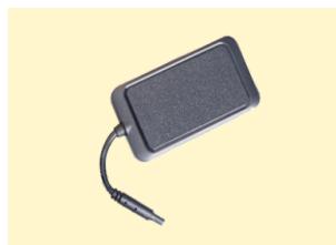
Fig 1: Vehicle Tracking System (VTS)

1. VTS: The Vehicle Tracking System is Bondstein's flagship product. This tracker allows users to monitor their vehicles. With this product, customers can track the location, expenses, distance traveled, and driving behavior.