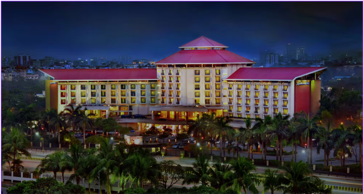
Figure 6: Radisson Blue Water Garden City

Bondstein designed and implemented a system for monitoring and controlling energy consumption in real-time at Radisson Blu Dhaka Water Garden, a luxury hotel located in Bangladesh. The hotel's energy consumption is monitored and controlled in real time through the utilization of IoT sensors within the system. The aforementioned system acquires data from diverse sources, including energy meters, HVAC systems, and lighting systems, and analyzes the data to detect potential avenues for energy conservation. Furthermore, the system can promptly notify hotel personnel of any irregularities in energy usage through real-time alerts. The implementation of the system has yielded a reduction in the hotel's energy consumption by as much as 20%, leading to considerable financial savings. The implementation of the system facilitated the enhancement of the hotel's sustainability and mitigation of its carbon emissions, a crucial objective for the hospitality sector. Furthermore, the system offers instantaneous insight into energy usage, empowering hotel personnel to promptly address any irregularities. The implementation of this measure has resulted in an enhancement of the hotel's operational efficiency and a reduction in downtime.