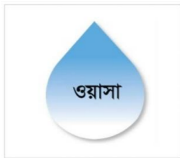
Figure 4: DWASA

Bondstein developed a Smart Water Management System (SWMS) for the Dhaka Water Supply and Sewerage Authority (DWASA) to address the water crisis in Dhaka, which is the capital city of Bangladesh and one of the most populous cities in the world. The SWMS utilizes IoT-enabled sensors, cloud computing, and machine learning algorithms to monitor the water supply and demand in real-time and optimize the water distribution network accordingly. The system can detect leakages, detect water quality, and prevent water theft, among other features (Rahman et al., 2020).