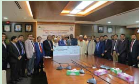
IUT & Al-Arafah Islami Bank Limited (AIBL) high officials at Cheque Handover Ceremony