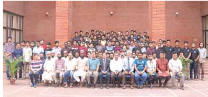
DEPARTMENT OF ELECTRICAL AND ELECTRONIC ENGINEERING