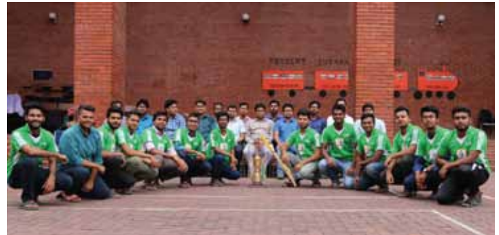
Inter-Departmental Cricket Champion 2018 (CEE Department)