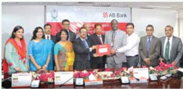
IUT & ABBL Cheque Handover Ceremony