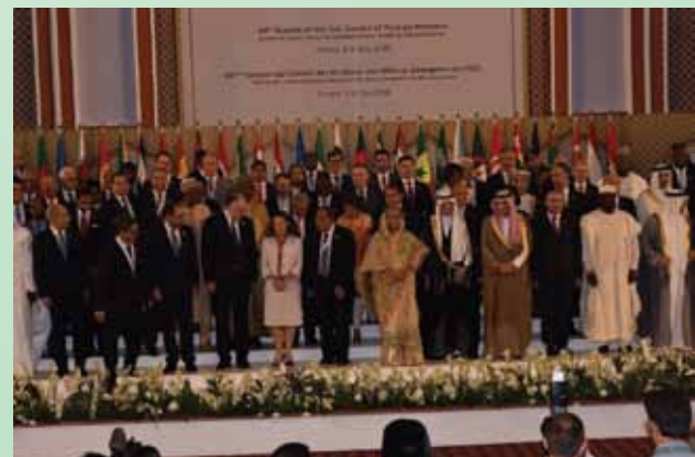
Leaders of OIC member states in the 45th Session of OIC Council of Foreign Ministers (CFM)

The 45th Session of the OIC Council of Foreign Ministers (CFM) was held in Dhaka on 5 & 6 May 2018.