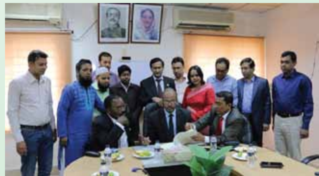
Agreement Signing Ceremony between TVE Department, IUT and Skills and Training Enhancement Project (STEP)