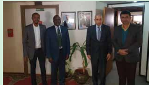
IUT and ICDDT officials in Morocco