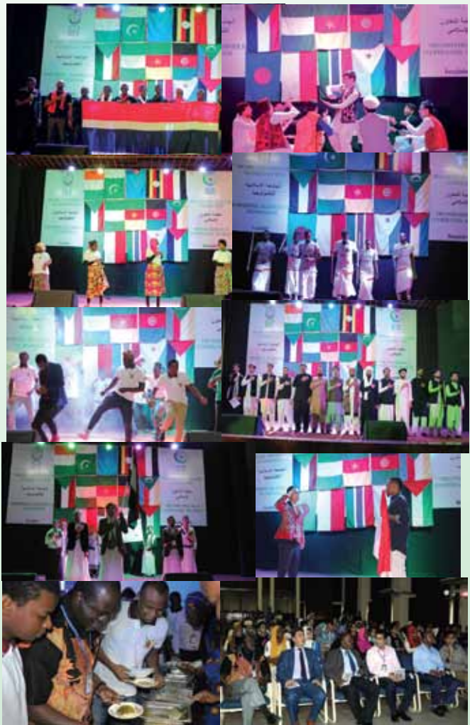
Cultural night program 2018.