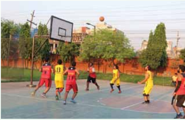
Annual Basketball Competition 2018