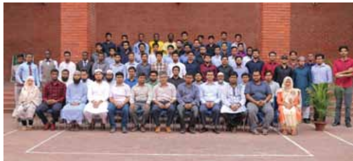
DEPARTMENT OF COMPUTER SCIENCE AND ENGINEERING