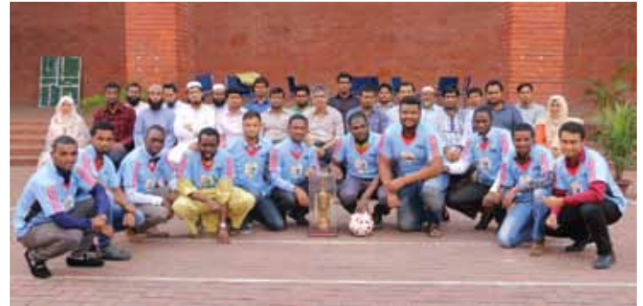
Inter-Departmental Football Champion 2018 (CSE Department)