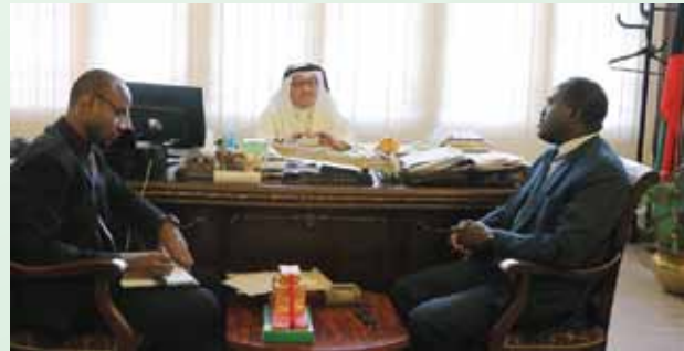
Acting Vice-Chancellor of IUT and Ambassador of Kuwait