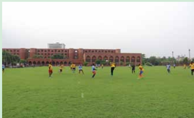
Inter-departmental Football Competition 2018

Football: Inter-departmental football Competition 2018 held on 14 May 2018. CSE Department became Champion and EEE Department became Runner-up.