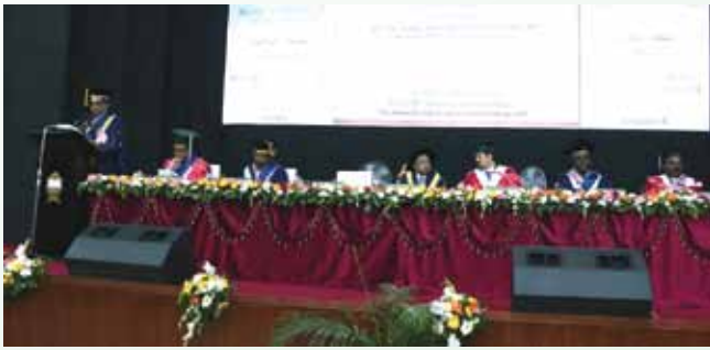
Vice-Chancellor of IUT speaking at the 31 st Convocation

activities all over the world. The popularity of the university is manifested by the fact that candidates aspiring to pursue education at this university far outnumber the places available for them.” Then he added, “We are sure that the leaders of the Ummah are well aware of the prospects and potentials of the university as a catalyst for the development of the human resources and will come forward in whatever way possible to turn it as the most visible demonstration of the Islamic solidarity and joint Islamic action.” Referring to the audience he said, “Our efforts towards academic excellence in the pursuit and dissemination of knowledge has begun to pay dividends and an intellectually challenging teaching-learning holistic environment is gradually evolving on the campus, paving the way for the university to take its rightful place among the reputed institutions of higher education.” To the graduating students he said “The supreme objective of life is the attainment of happiness and that can only be achieved through your positive attitude towards life.”