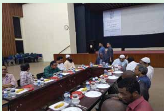
IUT Iftar Party 2018 hosted by the Acting Vice-Chancellor