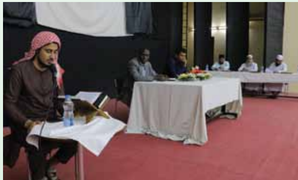
Holy Quran Recitation Competition 2018