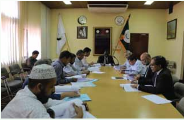
CASR in its 41 st session