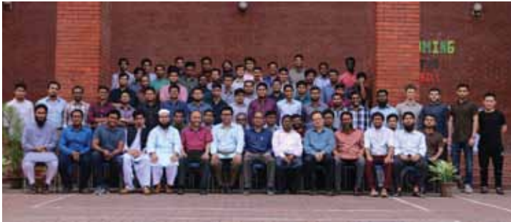
DEPARTMENT OF MECHANICAL AND CHEMICAL ENGINEERING