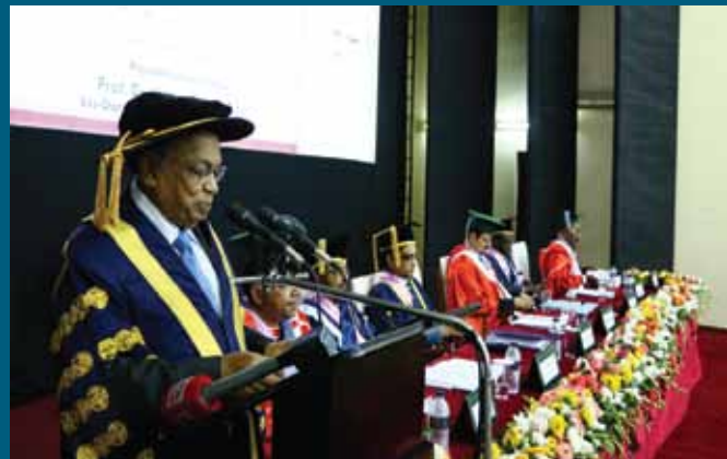
Foreign Minister of Bangladesh H.E. Mr. Abul Hassan Mahmood Ali, MP, speaking as Chief Guest of the 31 st Convocation of IUT.

Honorable Foreign Minister also said “I believe the OIC would bring in necessary assistance for expansion and success of this new initiative by arranging funding for the second phase of the female dormitory building project.” He mentioned “We wish to see the institution turning into a centre of excellence.” In his speech addressed to the graduating students he mentioned that, “You are joining the group of technology providers, innovators and scientific community and should not depend on your governments alone for work and job. Please remember the dictum - “give knowledge to a wise man and he will yet be wiser.” The University has done its duty. Now go out into the wider community and find your niche.”