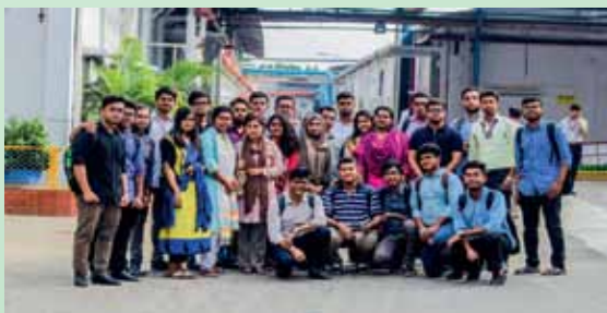
Faculty and Student of BTM Department in Industrial Tour

Students from BTM department visited Amber Denim Ltd. as a part of their “Organizational behavior” course under the supervision of teachers of the department on 14th July, 2018. An interactive session was arranged between BTM students and the company managers so that the students may familiarize themselves with operation of a company. Lastly, a questionnaire session was held where the students asked different queries about certain aspects of organizational behavior in mentioned company. On 13th September, 2018, another group of students visited Zaber and Zubair Fabrics Ltd. and got to know about certain bits and techniques of a textile manufacturing company. The host company had a session about their R&D section primarily to give the visitors an idea about the vast impact of their company on the textile manufacturing sector.