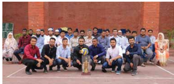
Inter-Departmental Volleyball Champion 2018 (CSE Department)