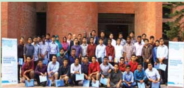
Participants and organizer of rainwater harvesting system training program