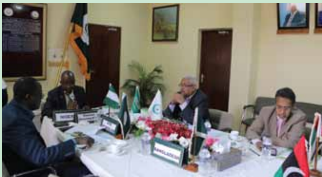
43rd Board Meeting of IUT