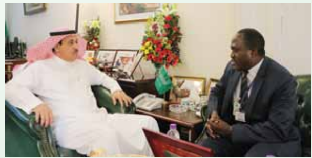
Acting Vice-Chancellor of IUT and Ambassador of K.S.A