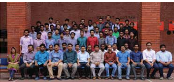
DEPARTMENT OF CIVIL AND ENVIRONMENTAL ENGINEERING