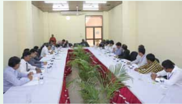
74 th Academic Council Meeting of IUT