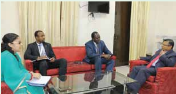
IUT Acting Vice-Chancellor and Director General of International Organizations, Ministry of Foreign Affairs, Govt. of Bangladesh in the meeting