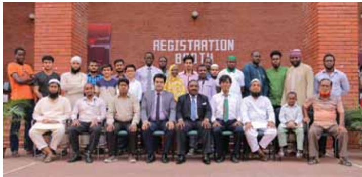
DEPARTMENT OF TECHNICAL AND VOCATIONAL EDUCATION