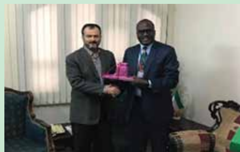
Acting Vice-Chancellor of IUT and Ambassador of Iran