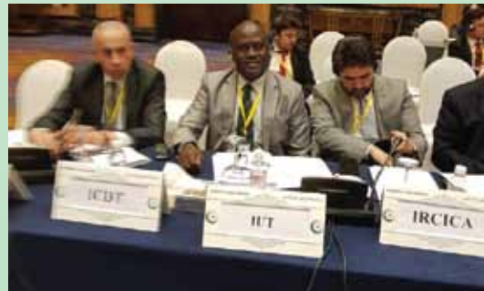
Brainstorming Session in Jeddah