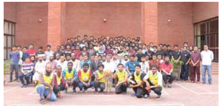
Inter-Departmental Basketball Champion 2018 (EEE Department)