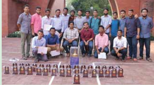
Prize distribution to the winners in prize giving ceremony 2018