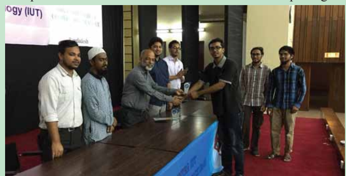
Intra IUT Truss Challenge 2018 organized by CEE Department, IUT

An event "Intra IUT truss Challenge 2018" was arranged at IUT auditorium on 11 th May 2018. As many as 27 teams from several departments participated in this event. The initiative was taken by some students of CEE department with support and guidance of their teachers. The main task of the event was to construct the most efficient truss bridge model with Popsicle sticks and glue. Through this event, students can enrich their knowledge and develop their skills in structural engineering practice. This is the first time such competition was arranged in IUT premises. “Team Trussed Dementia” a team comprising