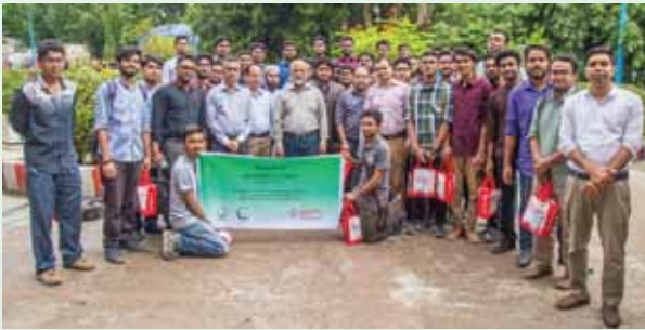
Students and Faculty members of CEE Department IUT Visited Seven Rings Cement Factory

Third-year students of CEE department visited Seven Rings Cement Factory at Kaligonj on May 13, 2018. Some fourth-year and PG students also joined in the trip. Through this visit, students got an opportunity to link their text book knowledge with real field application. CEE department is continuously doing these activities to enhance university-industry relationship.