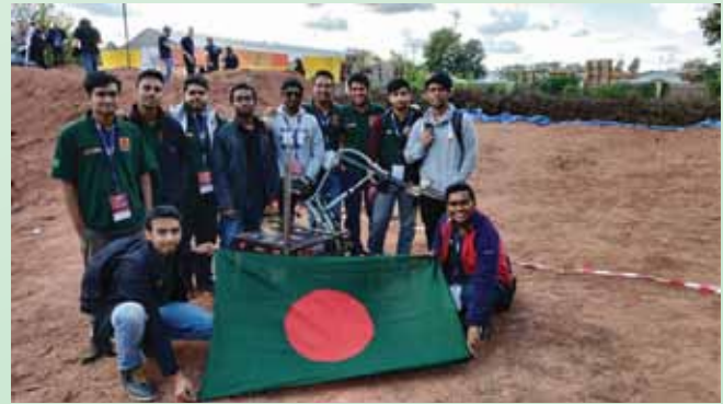
“IUT Avijatrik” European Rover Challenge 2018 in Poland

“IUT Avijatrik” team ranked 1st position among all the universities from South Asia region and 2nd position among universities from Asia region. Despite the tight schedule of relentless classes and myriad academic burdens in IUT, the team members of “IUT Avijatrik” and “IUT_MarsRover” managed to squeeze out their time in building this dream project. The story of this rover can inspire thousands of technology enthusiasts from OIC member states.