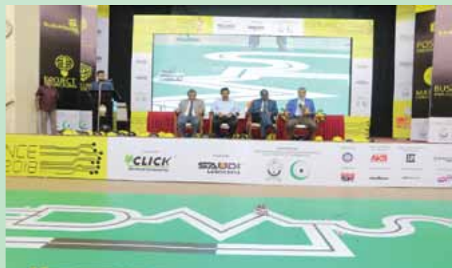
Robotics Competition of ESONANCE 2018