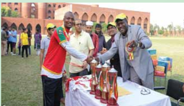
Prize giving of Annual Athletic Competition 2018