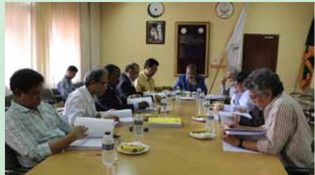
42 nd CASR Meeting of IUT

The 42 nd meeting of the Committee for Advanced Studies and Research (CASR) was held on 18 October 2018 under the Chairmanship of Acting Vice-Chancellor (In-Charge). All heads of department and external members of CASR were present at the meeting. Agendas from different academic departments were discussed in the meeting. The CASR committee approved several PhD thesis, Master's thesis proposal, ACETS rules, selection of post-graduate thesis supervisor for the post-graduate students of different departments.