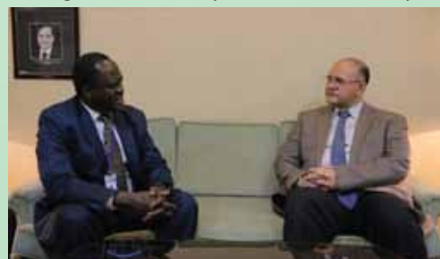
Acting Vice-Chancellor of IUT and High Commissioner of Pakistan