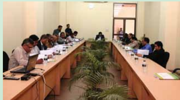
73rd Academic Council Meeting of IUT