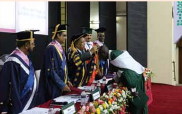
Awarding OIC Gold Medal in 31 st Convocation of IUT