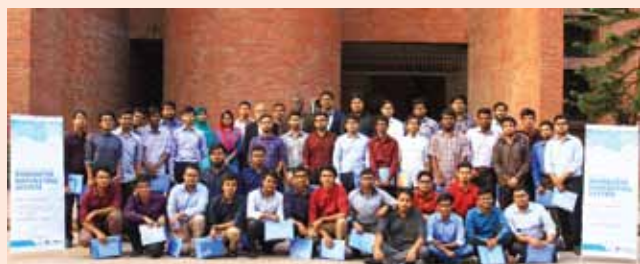
Participants and organizer of rainwater harvesting system training program