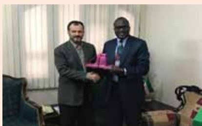
Acting Vice-Chancellor of IUT and Ambassador of Iran