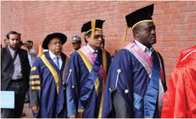
A partial view of the Academic Procession of the 31 st Convocation of IUT