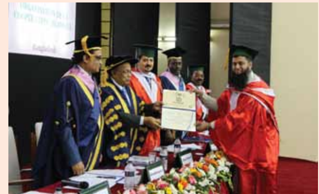
Awarding Ph.D Degree in 31 st Convocation of IUT