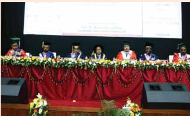
31 st Convocation of IUT