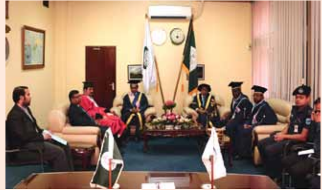
Chief Guest of the 31 st Convocation, Vice-Chancellor of IUT, Chairman, Governing Board, IUT and Other Distinguished Guests