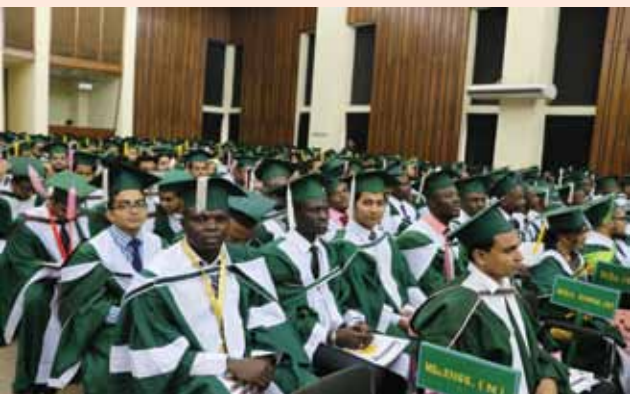
A section of Graduating Students of the 31 st convocation of IUT