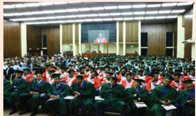
Audience, Invited Guests and Graduating Students of the 31 st Convocation of IUT