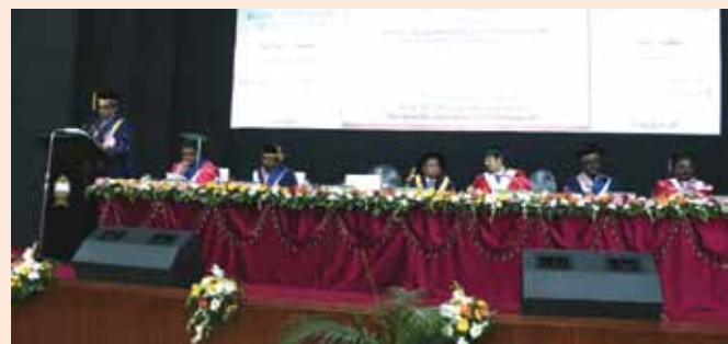
Vice-Chancellor of IUT speaking at the 31 st Convocation