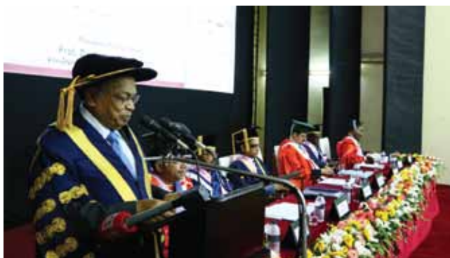
Foreign Minister of Bangladesh H.E. Mr. Abul Hassan Mahmood Ali, MP, speaking as Chief Guest of the 31 st Convocation of IUT.

Honorable Foreign Minister also said “I believe the OIC would bring in necessary assistance for expansion and success of this new initiative by arranging funding for the second phase of the female dormitory building project.” He mentioned “We wish to see the institution turning into a centre of excellence.” In his speech addressed to the graduating students he mentioned that, “You are joining the group of technology providers, innovators and scientific community and should not depend on your governments alone for work and job. Please remember the dictum - “give knowledge to a wise man and he will yet be wiser.” The University has done its duty. Now go out into the wider community and find your niche.”