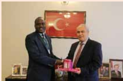
Acting Vice-Chancellor of IUT and Ambassador of Turkey