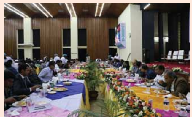
Dinner of the 31 st convocation of IUT