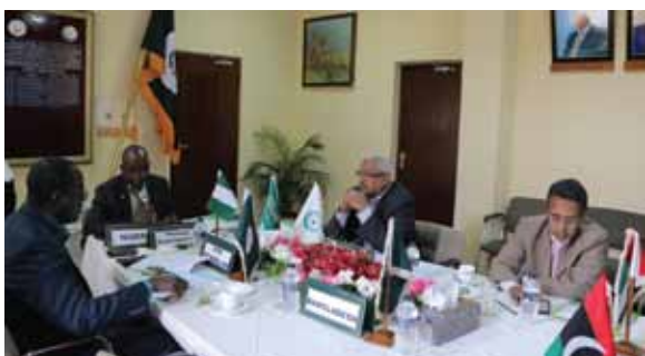
43rd Board Meeting of IUT