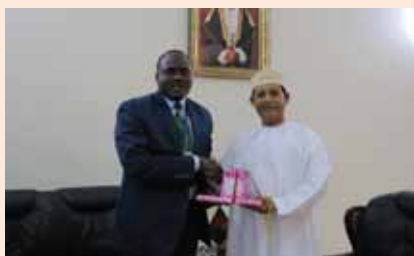
Acting Vice-Chancellor of IUT and Ambassador of Oman