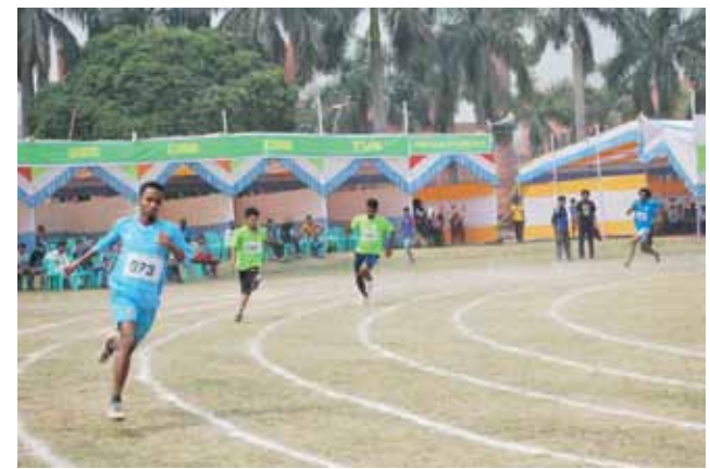
400 m Sprint event of the annual athletic competition 2017

There were 24 events on the day of competition, e.g., 100m, 200m, and 400m Sprint, 50m Walk for Female Teachers, High Jump, Spot Put, Running Board Jump, Cycle Race, Tug of War and many more. The finals of some events like Running-Triple-Jump, Javelin Throw, Discuss Throw, Pole Vault and 5000m Race were held on 01 February and 08 February 2017. There were separate events for