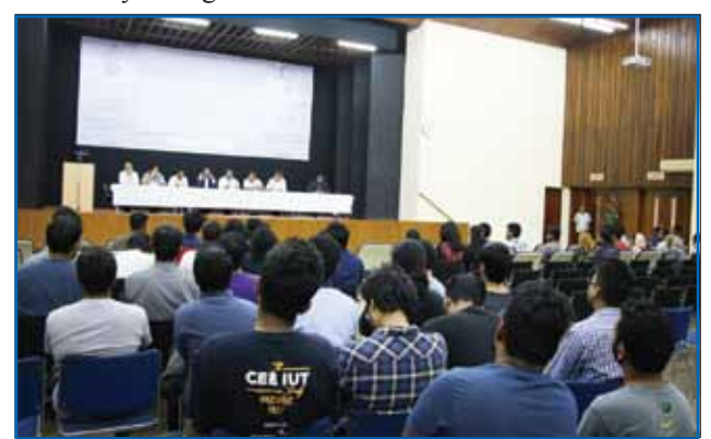
Vice-Chancellor Meeting With the Students

The students have been advised to take advantage of the opportunity of meeting the Vice-Chancellor and management to help improve the overall atmosphere by exchanging views and thereby reduce the communication gap between the University management and the students.