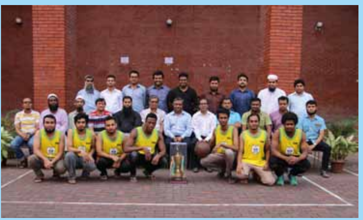
Inter-Departmental Basketball Champion 2017 (EEE Department)