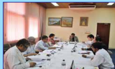
14th Meeting of IUT Syndicate