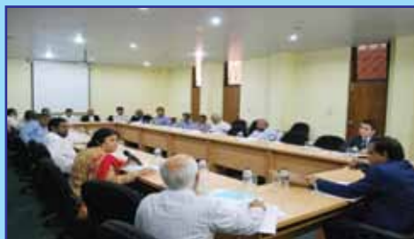
70th Meeting of IUT Academic Council