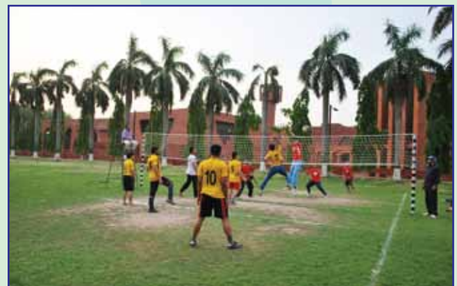
Inter-departmental Volleyball Competition 2016

Inter-departmental Volleyball: Inter-departmental Volleyball Competition 2016 was held on 18 April 2016. MCE Department became Champion and EEE Department became Runner-up respectively.