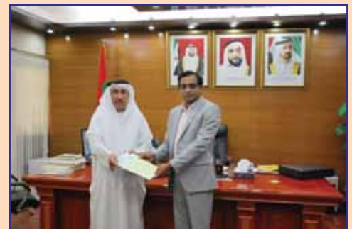
Ambassador of U.A.E. and VC of IUT