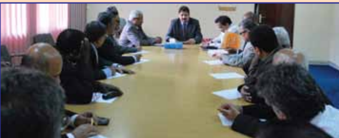
Chairman of the Governing Board of IUT meeting with High officials and Departmental Heads of IUT