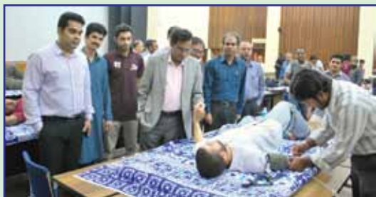
IUT Blood Donation Program 2016