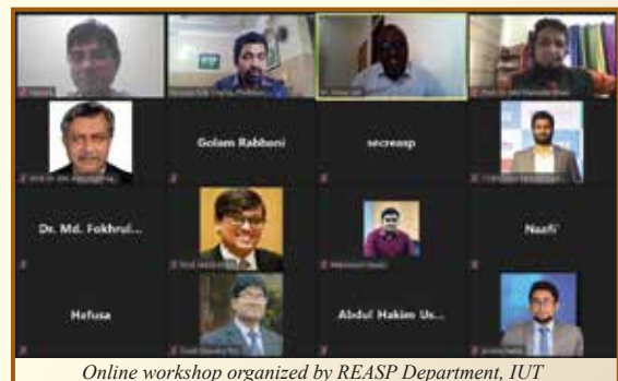
Online workshop organized by REASP Department, IUT