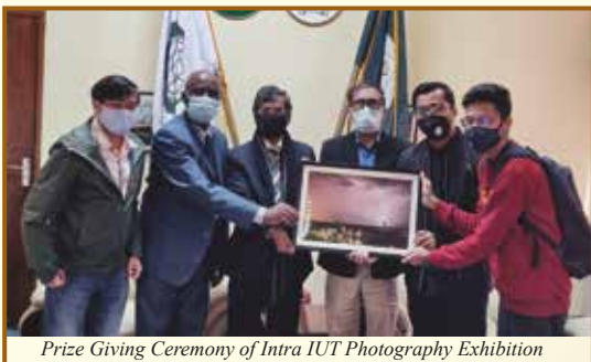
Prize Giving Ceremony of Intra IUT Photography Exhibition