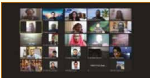
Webinar on “The Future of Manufacturing: Sustainable Products, Processes, and Systems” by MPE Department, IUT