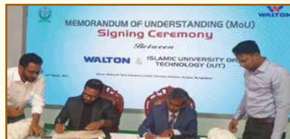
MoU signing ceremony between Islamic University of Technology (IUT) and Walton Hi-Tech Industries Limited