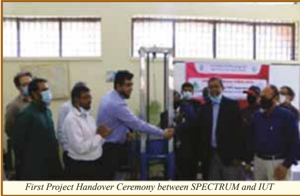
First Project Handover Ceremony between SPECTRUM and IUT

are inspiring and encouraging for the students and researchers to take up the contemporary challenges faced by the host country and Ummah and come up with tangible solutions.