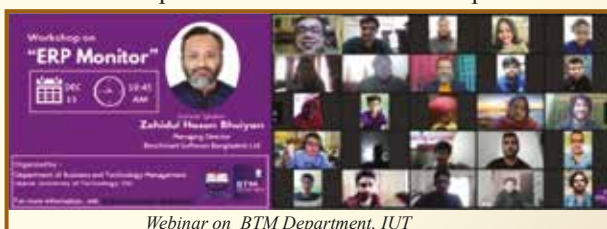
Webinar on BTM Department, IUT