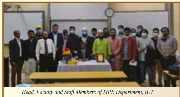
Head, Faculty and Staff Members of MPE Department, IUT