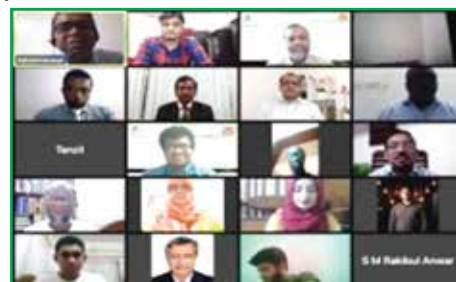
Participants of "Professional Lecture Series"- First Webinar on "Industry-Academia Collaboration"