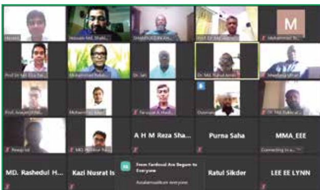
Workshop on "Scientific Paper Writing for High Impact Journals"